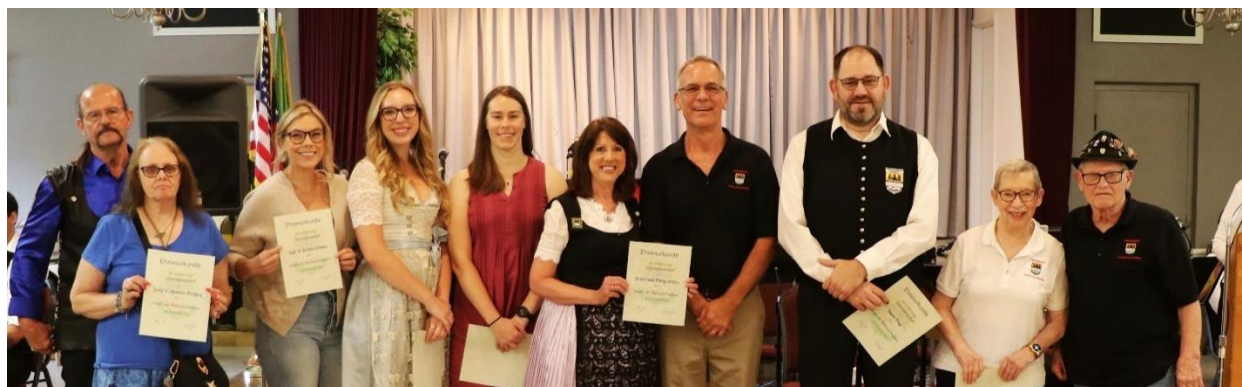
Promoted from Associate to Full Members