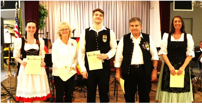
Recipients of Verdienstnadel in Gold