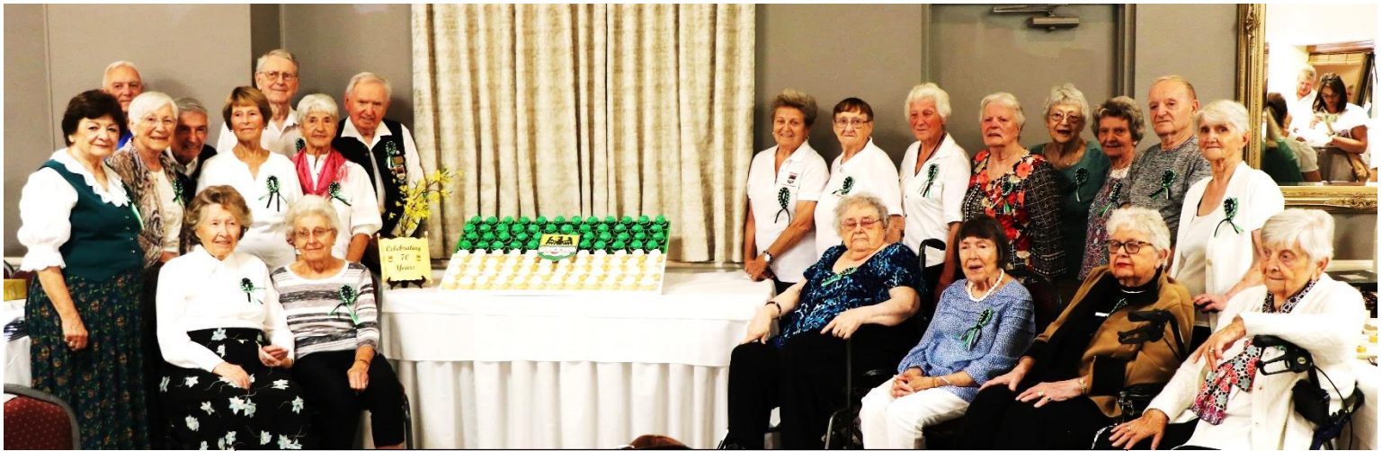
Members honored on the 80 th Anniversary of their Forced Expulsion