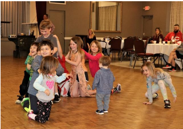
Club Appreciation Dinner